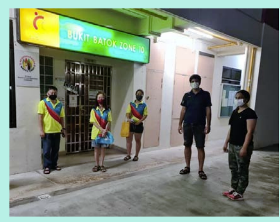
(Above): Volunteers from the Bukit Batok Zone 10 Resident Committee

In the coming months, PHC will be working with Bukit Batok Zone 10 RC to roll out various activities such as litter picking, neighborhood walk-about and online engagement. This is to encourage residents to take ownership of the cleanliness of their common spaces. Through the Sustainable Bright Spot programme, PHC seeks to reach out to residents in the community, to inculcate a deeply held value of keeping public spaces clean and nurture a culture of personal responsibility for their estate.