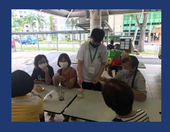
(Above): Residents of Yio Chu Kang Division taking part in the folding of food scrap boxes.

You can do your part by disposing food scraps using these hand-made boxes to keep the tables clean and hygienic. Take action to help create a truly clean Singapore!