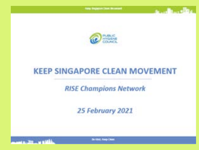
See you at our next RISE Network meeting on 25th Feb 2021!

The next RISE Network meeting will be on 25 February 2021. Details will be announced closer to date.