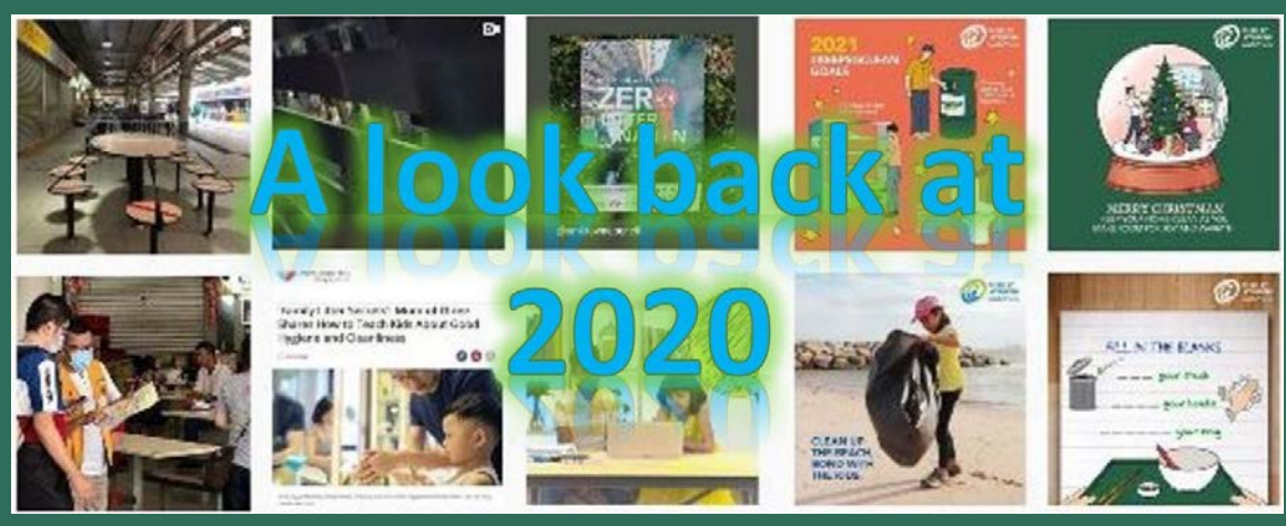
(Above): Summary of PHC's social media posts of 2020, a year marked by the Circuit Breaker, Safe Distancing and a COVID-19 pandemic in Singapore.

Right from the start of 2020 and in the early days of the COVID-19 pandemic, PHC announced the "Keep Viruses at Bay" initiative to engage coffee shop owners on good public hygiene and cleanliness practices to help counter COVID-19 transmission. The event supported the launch of the SG Clean Quality Mark certification in coffee shops. Coffee shop operators were encouraged to step up on their cleaning regimes and asked to remind visitors and patrons to practise good personal hygiene habits. PHC also engaged building owners such as Keppel Land to encourage them to adopt good hygiene practices at common touchpoints in their premises, such as lift buttons and door handles. We also reached out to the hospitality industry through the Singapore Hotel Association and urged their members to adopt similar measures in their hotels.