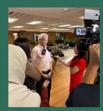
Chairman being interviewed by CNA f or PHC's Keep Viruses At Bay initiative.

Right from the start of 2020 and in the early days of the COVID-19 pandemic, PHC announced the "Keep Viruses at Bay" initiative to engage coffee shop owners on good public hygiene and cleanliness practices to help counter COVID-19 transmission. The event supported the launch of the SG Clean Quality Mark certification in coffee shops. Coffee shop operators were encouraged to step up on their cleaning regimes and asked to remind visitors and patrons to practise good personal hygiene habits. PHC also engaged building owners such as Keppel Land to encourage them to adopt good hygiene practices at common touchpoints in their premises, such as lift buttons and door handles. We also reached out to the hospitality industry through the Singapore Hotel Association and urged their members to adopt similar measures in their hotels.