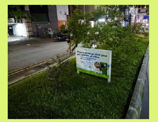
(Above): Example of an Out-Of-Home standee similar to the ones being proposed for PHC's 2021 outdoor campaign assets.