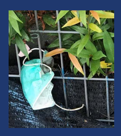
Littered masks scattered on pavements (above) and washing up on parks and beaches (below).